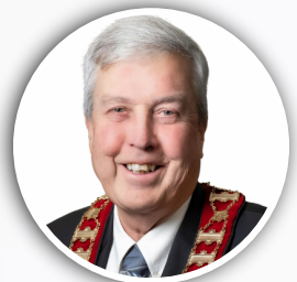
Mayor Steve Ogden