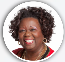
Hon. (Dr.) Jean Augustine