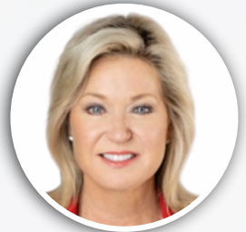
Former Mayor Bonnie Crombie