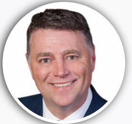
Premier Dennis King