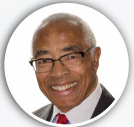
Senator Don Oliver