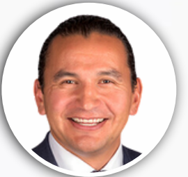
Premier Wab Kinew