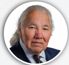
Senator Murray Sinclair