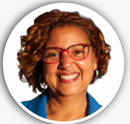
Senator Bernadette Clement