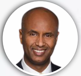
Hon. Ahmed Hussein