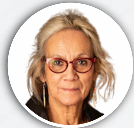
Senator Mary-Jane McCallum