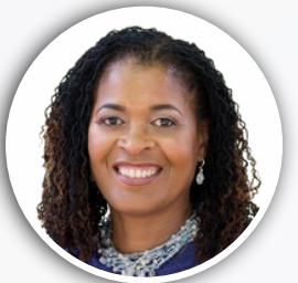
Senator Paulette Senior