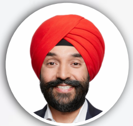
Hon. Navdeep Bains