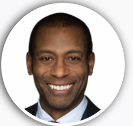
Hon. Greg Fergus